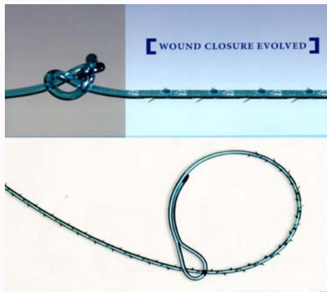
Figure 2: A total of 15 cm of 3-0 V-Loc 180 suture on a V-20 needle (26 mm tapered).

Lee et al. [3-5] first reported the incorporation of a knotless, unidirectional, barbed suture into the staple conserving technique for delta-shaped gastroduodenostomy after laparoscopic distal gastrectomy in the domain of digestive surgery. In the domain of laparoscopic colorectal surgery, we reported first a knotless, unidirectional, barbed suture to the intracorporeal closure of the pelvic cavity with laparoscopic APR [7]. In this report, we introduce a knotless, unidirectional, barbed suture to the intracorporeal closure of between abdominal wall and elevated sigmoid colostomy with laparoscopic APR.