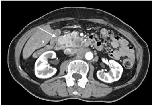
Figure 1: Abdominal CT showing pancreatic head mass (arrow), retroperitoneal infiltration and enlarged para-aortic nodes.