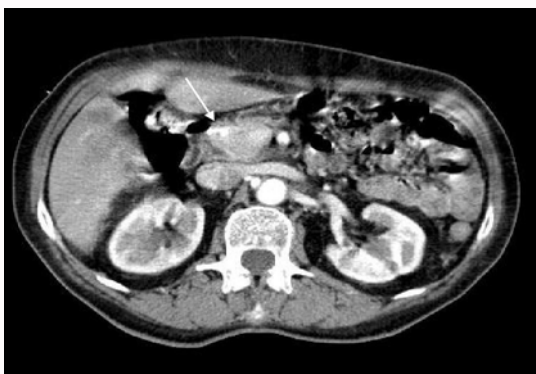
Figure 2: Abdominal CT showing reduction of the tumor (2.3 cm) (arrow) and of para-aortic nodes (< 1 cm).

favour of the group receiving FOLFIRINOX was seen [5]. However, complete pathological response after chemotherapy in advanced pancreatic cancer is a very rare event. We report a case of a complete pathological response after FOLFIRINOX treatment in a patient with advanced pancreatic adenocarcinoma, who subsequently experienced brain metastases.